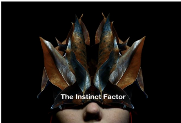
White Milano campaign, September 2023